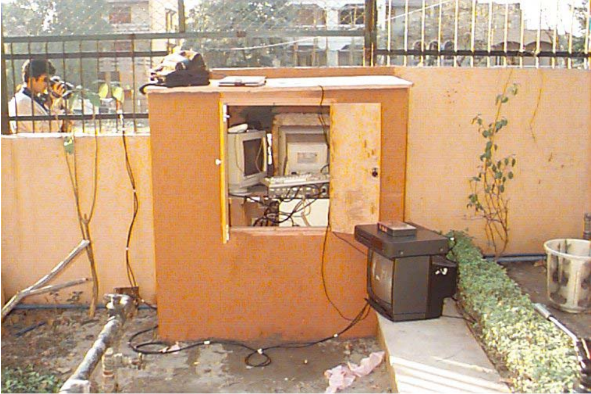
Photo2: Construction of the kiosk housing on the office side of the wall.