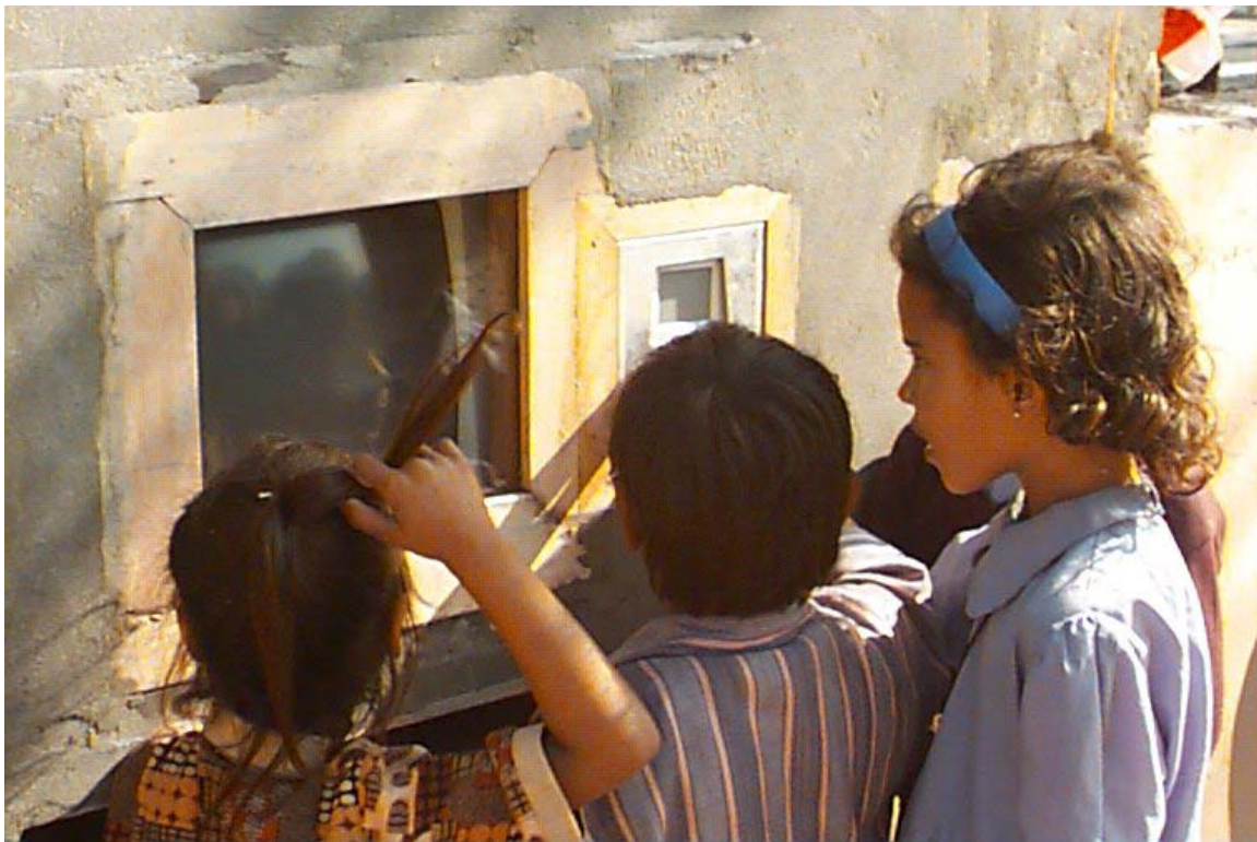
Photo1: Children examining the kiosk on the first day.

The kiosk was constructed such that a monitor was visible through a glass plate built into a wall. A touch pad was also built into the wall (see photo 1). The PC driving the monitor