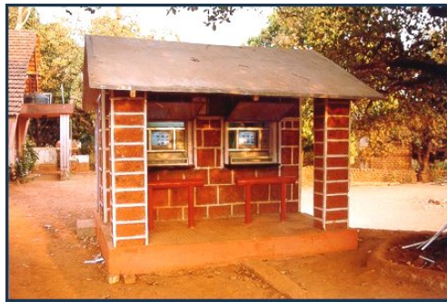
Photo 1. MIE kiosk, Kalse Village, Sindhudurg District, India

MIE kiosks were set up in the villages of Sindhudurg district of Maharashtra State in India, in April 2002 (see photo 1). The kiosks are placed in playgrounds or close to schools.